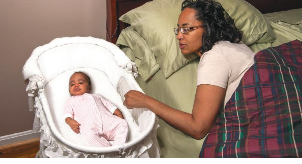
Room sharing reduces the risk for SIDS.